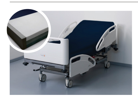
PC150 3-Core Mattress

The 3-Core Mattress offers a high level of pressure care suitable for a wide range of current hospital and nursing home beds. This mattress is often recommended by therapists for residents requiring extended bed stay periods (pressure care).