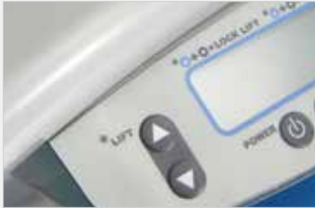
Electronic lift enables 40.6cm of height adjustability.