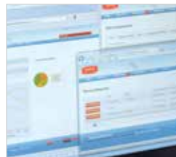
Proactive Fleet Management

Personal preference settings are saved and transferred to all carts