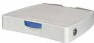
3" Drawer Electronic lock or non-locking

Flexibility to configure workstation with storage drawers in 3" or 6" depths.