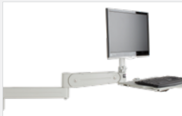
Optional extension arm allows sharing between two beds.