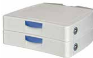
2 x 3" Drawer Electronic lock or non-locking