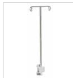
RUBBFG9M38-IV IV Pole 63.5cm H x 1.9cm diameter