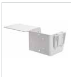
Barcode scanner charging station shelf Enquire for model number