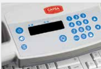
Intuitive locking and security system