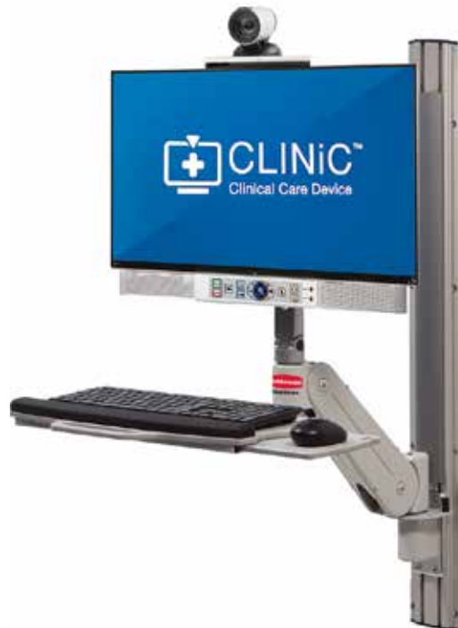
Fluid™ Arm HD