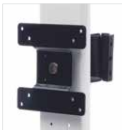
RUBB4170096 Rotating 12.7cm height adjustment monitor bracket