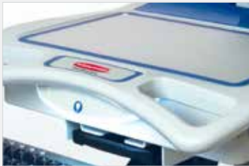
Integrated keyboard light features auto shut-off for nighttime use.