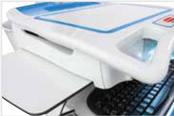
Secondary work surface slides out left or right to supplement primary work surface.