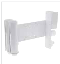
RUBB4170088 LCD Access pack for meds cups, tape and alcohol wipes

* Available for M38 RX only ** For use on laptop cart only *** Mounting bracket only - Caviwipes Bracket sold separately