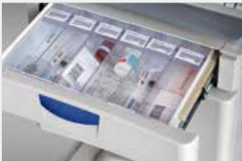
Store small items with drawer trays that can be sub-divided to meet specific storage needs

Designed specifically to accommodate your choice of laptop computers, the LX5 Laptop Cart offers a lightweight and non-powered design that lets you configure the cart to best meet your requirements. The LX5 promotes simplicity and value to help lower your total cost of mobilizing health IT software.