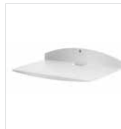
RUBBFG9M38-RL Large printer shelf 38.1cm W x 22.9cm D