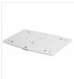
RUBBFG9M06026001 Mounting plate for sharps bracket and accessory bins