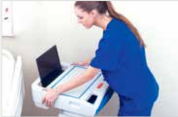
Secure placement of laptop allows for easy access to power button.