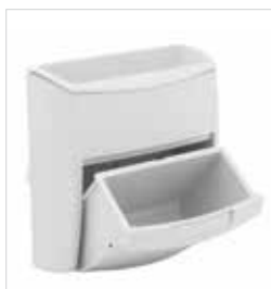
RUBBFG9M06038501 M38 RX Locking side bin with removable bin*