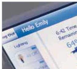
Individual Preference Settings

Personal preference settings are saved and transferred to all carts