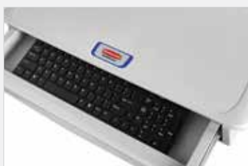
Optional 50.8cm x 29.2cm work surface houses standard keyboard tray.