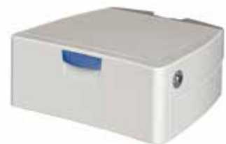
6" Drawer Electronic lock