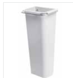
RUBBFG9M38-WB Trash bin