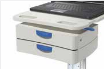
Optional 3" or 6" key lock storage drawers provides secure storage of medications and supplies