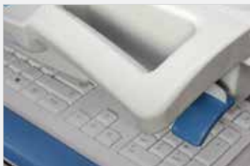
Comfortable two-position handles simplify mobility