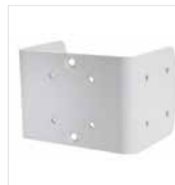
RUBBFG9M06027501 3-sided mounting bracket