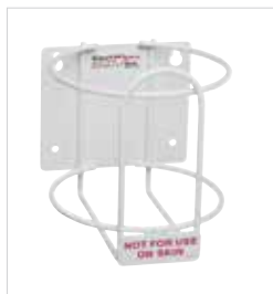
RUBB4170398 Mounting bracket for Caviwipes Bracket ***