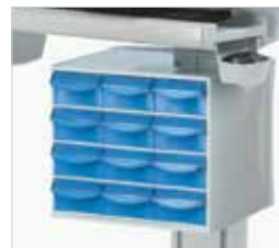
Flexible to Meet Changing Needs

Independent fleet management software allows for remote configuration and upgrades, asset monitoring and utilisation, and cart locators