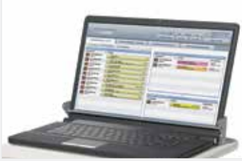
Capable of accommodating widescreen laptops