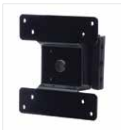
RUBB9M38-MR Rotating monitor bracket