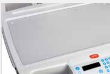
Integrated storage pods and protective document cover