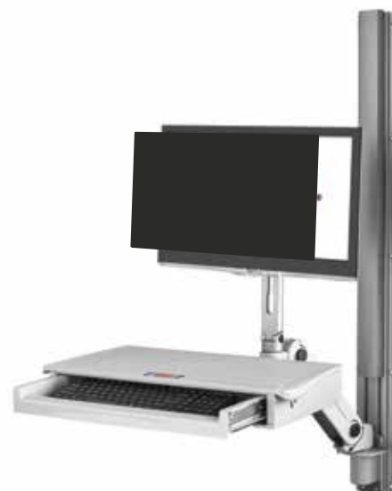
Premium Fluid Arm LT