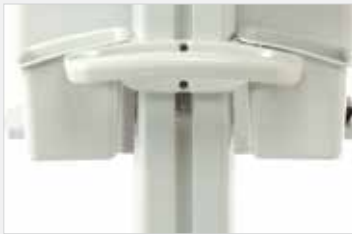
T-track provides a universal mounting point for accessories.

With its lightweight construction, compact and ergonomic design and large work surface, our M40 Computing Cart is the best choice for your mobile electronic documentation needs.