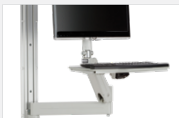
35.6cm of incremental height adjustment and 270° rotation.

With unmatched strength and style, the Fluid™ Arm adjusts with a single-handed motion from a seated to standing position. Designed to provide maximum reach, the Fluid™ Arm is ideal for sharing between two patient beds.