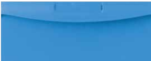
RUBB1779309 Pharmacy Robot Envelope drawer