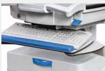
Flexibility to configure workstation with storage drawers or bins

The M38e from Capsa Healthcare is an evolution of the most proven point-of-care computing cart in healthcare.