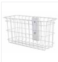
RUBBFM9M38-AA Wire basket