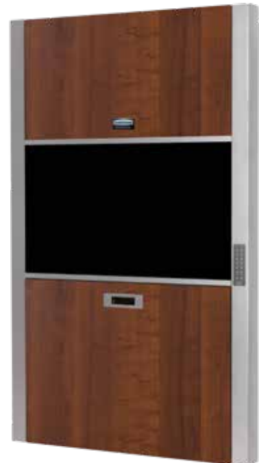
430 Wall Cabinet Workstation