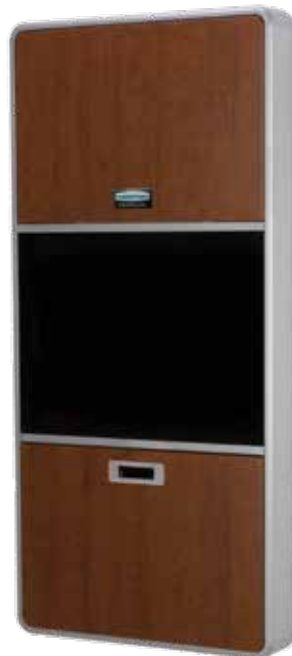
423 Wall Cabinet Workstation

The 430 Wall Cabinet Workstation is designed to promote a professional appearance specific to the healthcare environment with a wide variety of finish selections to choose from. The wall cabinets are easy to use with improved ergonomic positioning of the keyboard and monitor, a large work surface and mouse area and an integrated task light.