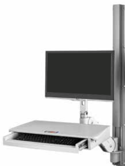
Premium Fluid Arm HD with extension arm